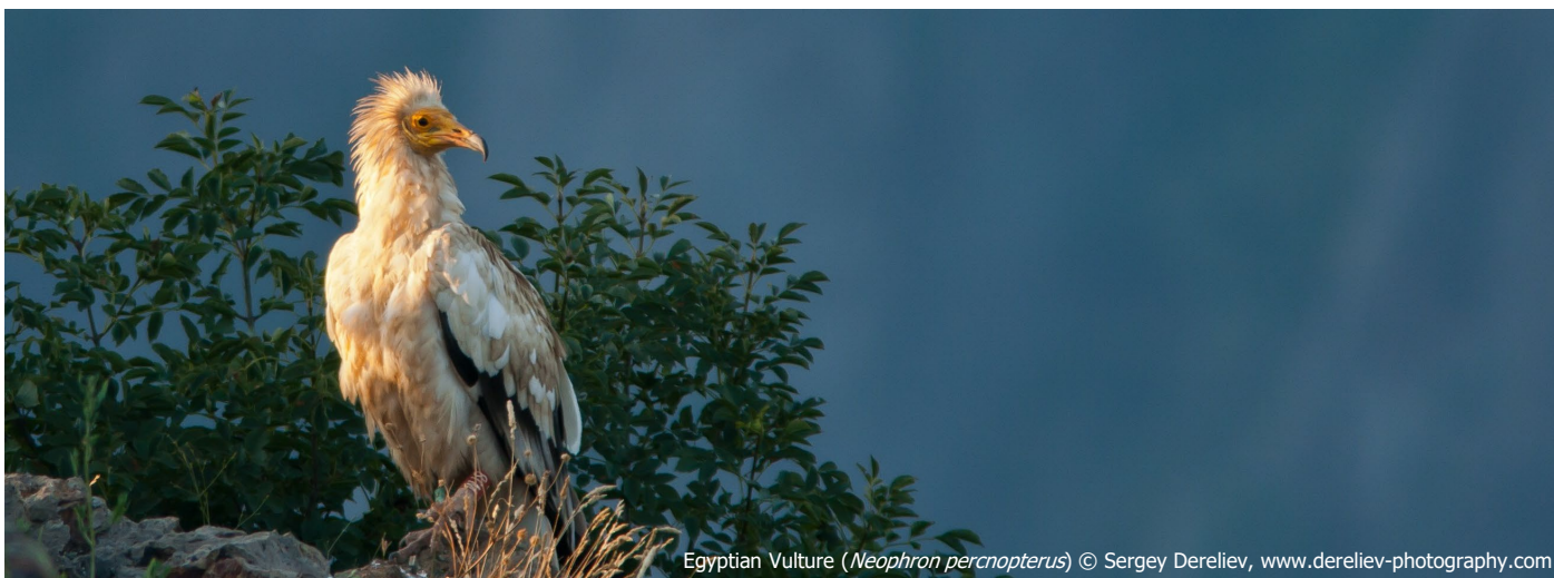
Egyptian Vulture ( Neophron percnopterus )