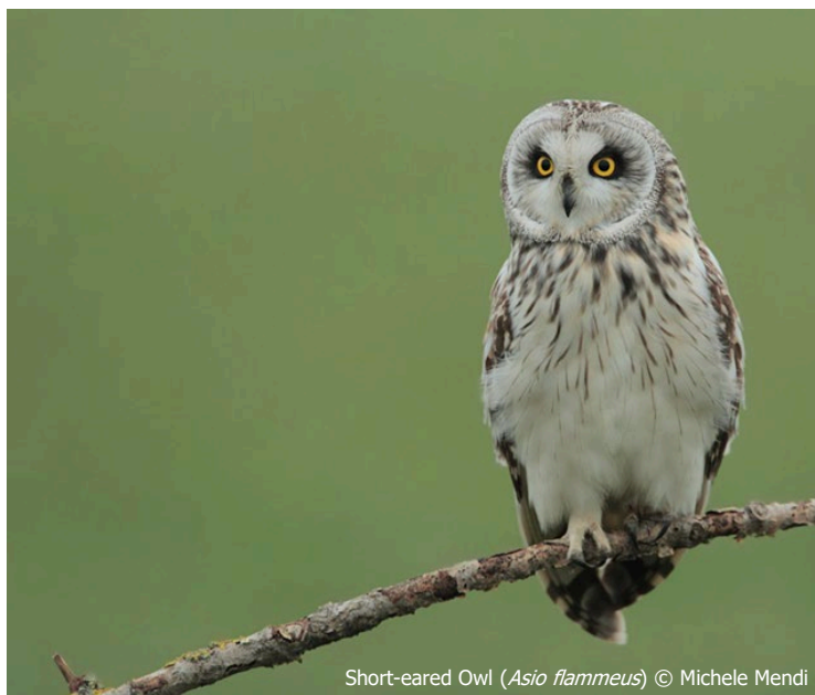
Short-eared Owl ( Asio flammeus )

The Coordinating Unit strives to support Signatories in collaborating and coordinating a full range of conservation actions to increase the effectiveness of the Raptors MOU. Working together to develop international partnerships is necessary to tackle the many threats that migratory birds of prey face.